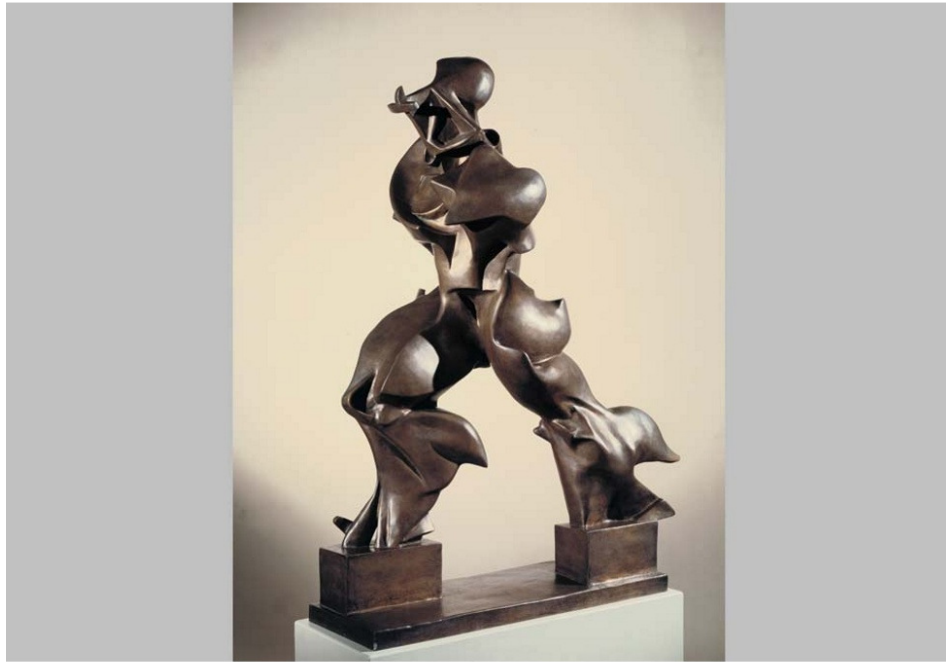
Umberto Boccioni - "Unique Forms of Continuity in Space", 1913, cast 1972

From Art Knowledge News Posted: 10 Dec 2011