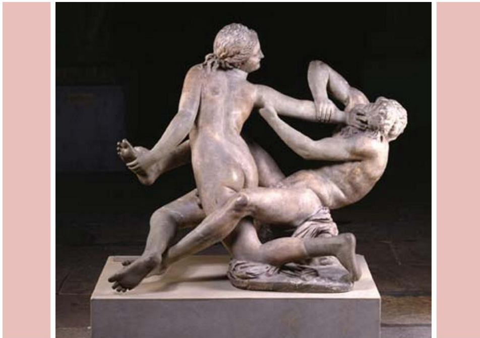
Silen und Hermaphrodit, Marble; Height : 90,6 cm; Skulpturensammlung; Foto: Klut/ Estel © Staatliche Kunstsammlungen Dresden

From Art Knowledge News Posted: 10 Dec 2011